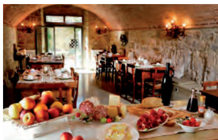
Villa Belpoggio, Tuscany