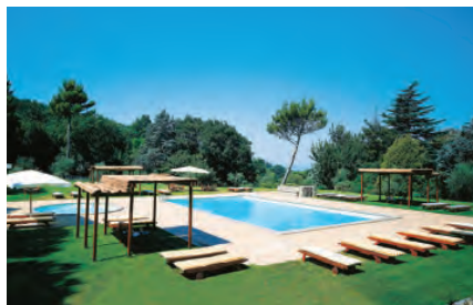
Villa Grazioli, Frascati