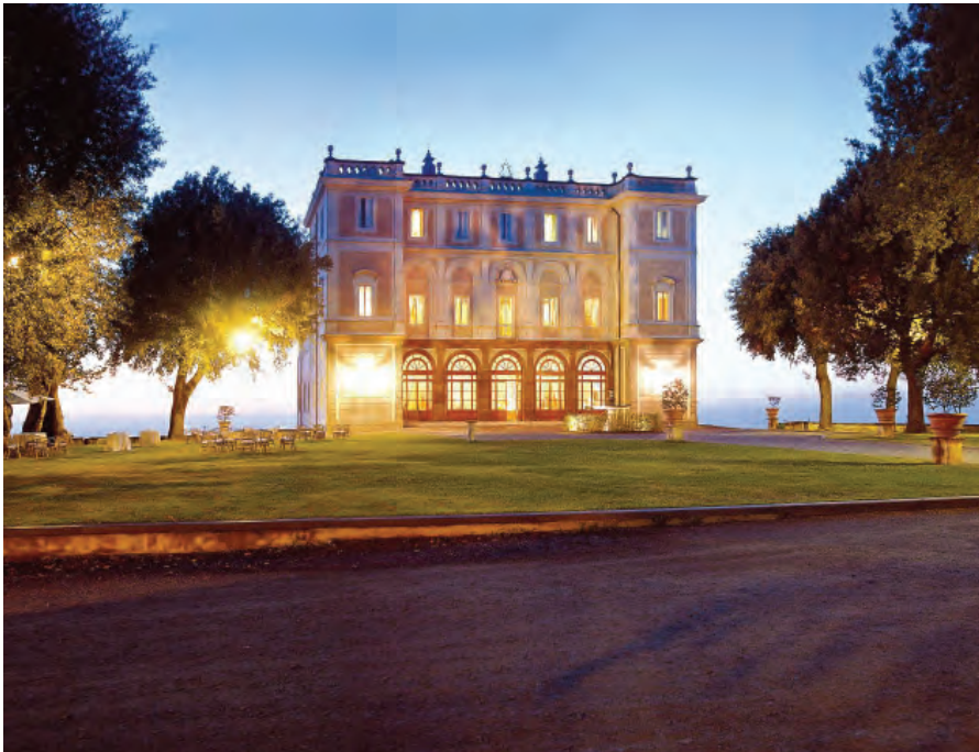
Villa Grazioli, Latium

Donato is adorned with original stained glass dating back to mediaeval times. The Duomo itself is an imposing building, grand despite its minimalist exterior detail, with a warm regal charm that suits the Arezzo style. For wine-tasting opportunities, head out into the neighbouring villages. The Villa la Ripa, for example, is a grand private home, surrounded by vineyards that fuel the independent, family business. The Villa offers vineyard tours, tasting sessions, and an opportunity to pick up some aromatic Tuscan souvenirs. To further escape the tourist spots, head into Cortona, Aghieri, or Monterchi on the hunt for the local goat's cheese or Florentine steak.