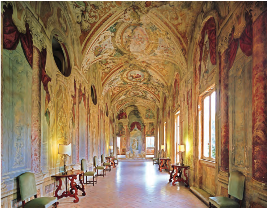
Villa Grazioli, Frascati