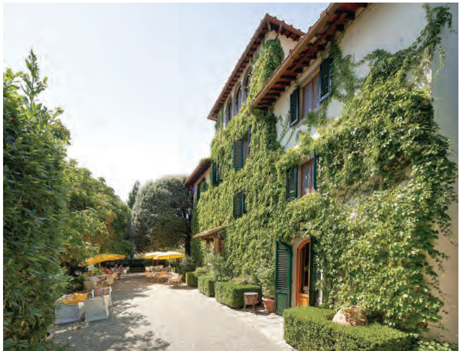
Villa le Barone, Tuscany

A charming boutique hotel in the Chianti region, Relais Villa Belpoggio boasts an authentic Tuscan style within refined landscaped gardens. Surrounded by olive groves, these gardens are characterised by pristine lawns and rose bushes, while expansive views typify the region, looking over the Pratomagno woods, the Chianti Mountains and the Arno Valley. The elegant mansion itself dates back to the 17th century and its rich history is evident in the antiques that decorate the warm and welcoming interior. Guest accommodation is certainly boutique, with each of the mere 10 guestrooms individually decorated to reflect the uniqueness of each room's dimensions. Some feature exposed stone floors and walls and others offer a distinctly Tuscan feel with terracotta floor tiles, dark wood furniture, log fires and wrought