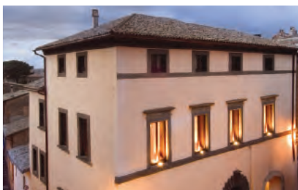
Palazzo Piccolomini, Orvieto

Former home of the wealthy Piccolomini pontificate family, Palazzo Piccolomini is a remarkable 16th-century building where a combination of Renaissance, medieval and Etruscan architectural elements come together to create a refined and atmospheric property of exceptional heritage and character. Situated in the heart of hilltop Orvieto, just steps from the cathedral and shopping area of Piazza della Repubblica and facing Piazza Ranieri, the Palazzo Piccolomini has undergone extensive renovation and restorative works to bring it back to its original historical splendour, yet with a nod to the contemporary, too. Serving a delicious breakfast each morning, the breakfast room is full of authentic character with a giant stone pillar supporting a coved ceiling, an ancient well and medieval stone staircase, whilst the frescoed lounge bar pays homage to the hotel's opulent past. The Hotel Palazzo Piccolomini consists of 32 rooms and suites, simply decorated in neutral tones with chestnut wood furnishings and terracotta tiled floors. Dining opportunities are plentiful in the many excellent and atmospheric restaurants and cafes surrounding the Hotel Palazzo Piccolomini.