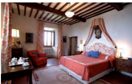
Villa le Barone, Tuscany

overlooking the Hill of Tuscolo. The Limonaia meanwhile offers classically-decorated, garden-facing rooms, whilst Elite rooms are slightly larger and boast wood ceilings. With splendid views over the gardens and towards Rome, the Charme Deluxe rooms and suites are situated in the main building as are the elegant Acquaviva Restaurant, serving a menu of Mediterranean specialities, and the vaulted Eliseo Bar, decorated with reproduction monochromatic stuccos. In summer, the Park Hotel Villa Grazioli's restaurant moves outdoors to the terrace, with wonderful panoramic vistas of the hanging gardens and Rome beyond. There's an inviting outdoor pool in the grounds, with golfing, water sports and a wellness centre all just a short distance away. The Park Hotel Villa Grazioli offers a complimentary shuttle service to and from Frascati railway station, where direct services run to Rome Termini station, bringing the multitude of treasures of the Eternal City within easy touching distance. All in all, a traditional and historical hotel tranquilly situated amidst the Frascati winelands and Castelli Romani.